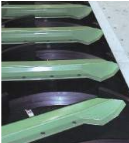
Picture on the right: Geiger MultiDisc® Screen – Fish Protection Systems