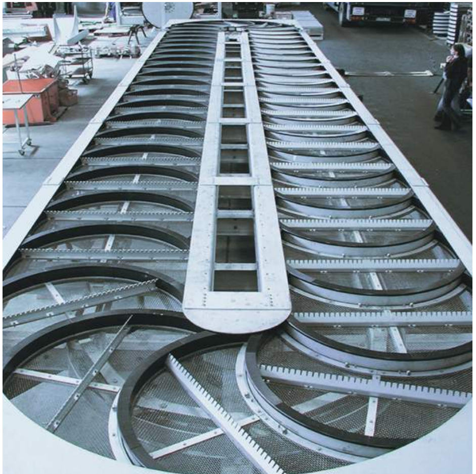
Geiger MultiDisc® during FAT Test at the Manufacturing Site in Germany